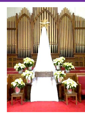
The Season of Advent